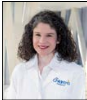
Jeanie Tryggestad, MD, OU Health Topic: Youth Onset Type Diabetes: Treatments, Complications, and the Path to Improved Outcomes