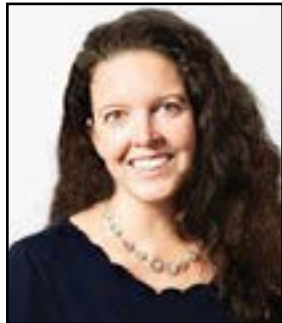
Ashley Weedn, MD, MPH, FAAP, OU Health Topic: Patient Access to Anti-Obesity Medications: a Practical Panel Discussion